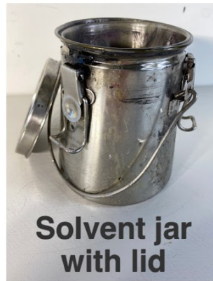
Solvent jar with lid